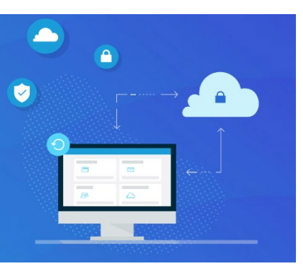
Backup, Restore, and Protect Data